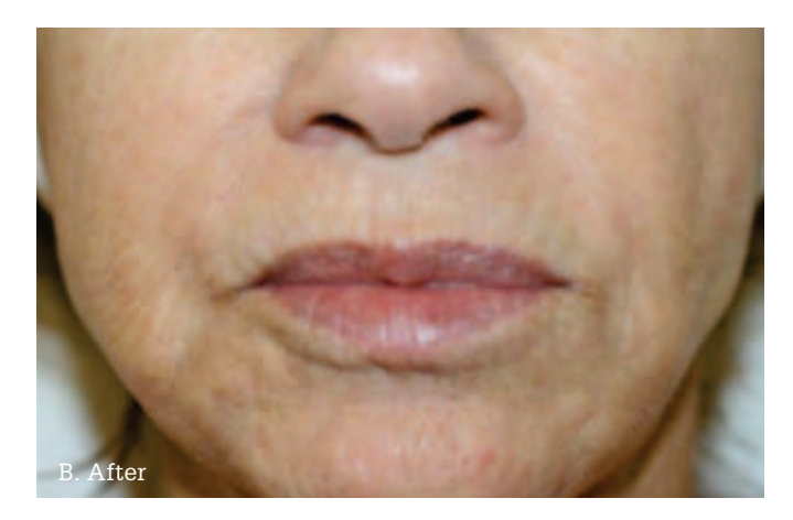
Figure 2. A 69 year old woman before (A) and 6 years after treatment of the perioral area with BroadBand Light therapy at least once per year (B).